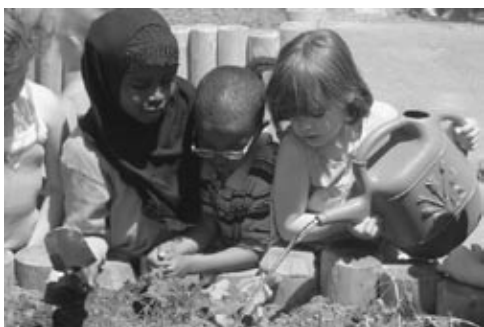
Nathan Clifford School students plant raised beds.

A Dora Small student uses his shadow to tell time by standing on the analemma with his arms raised. Others