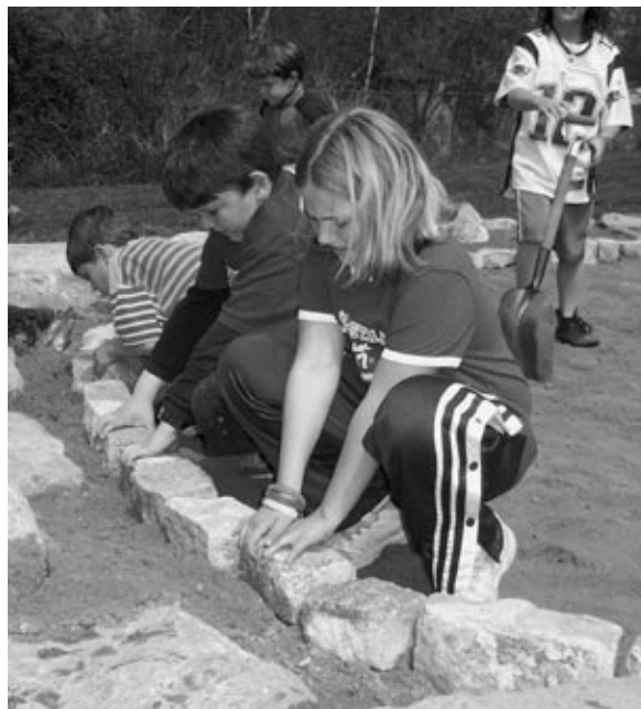
Small School Students at work improving their school grounds.

Watch – a child leaps in the air, lands in a cloud of dust. She and her classmates at Longfellow are in the outdoor