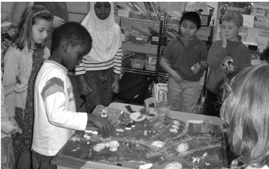
Students at Riverton School plan improvements for their school grounds.